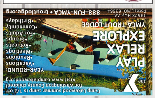
We thank our gracious advertisers!